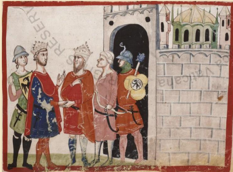
Frederick II Hohenstaufen and the Ayyūbid Sultan al-Malik al-Kāmil agree to the peaceful surrender of Jerusalem (1229)