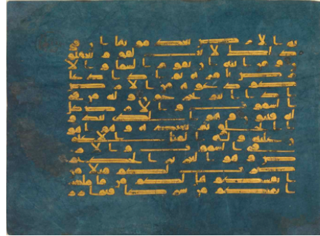
Folio of The Blue Qur'ān. New York, Metropolitan Museum.

István T Kristó-Nagy https://experts.exeter.ac.uk/4333-istv%C3%A1n-t-krist%C3%B3nagy