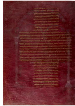
Orléans Bible, Paris, BnF.